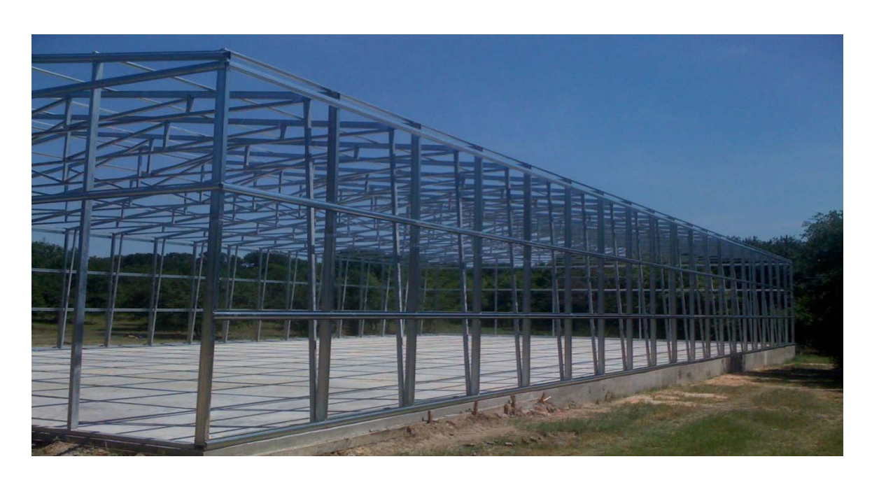
THE WORLD'S MOST ADAPTABLE STEEL BUILDING SYSTEM